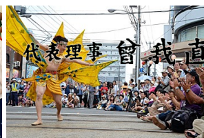
Outreach (collaborating festivals)